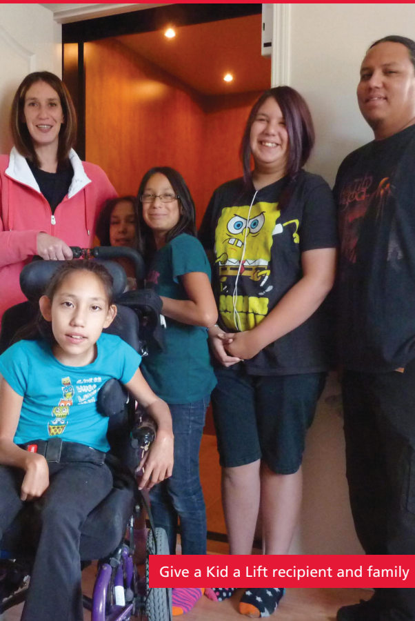
Give a Kid a Lift recipient and family

Through passion and commitment we make a difference in the lives of people with disabilities and special needs.