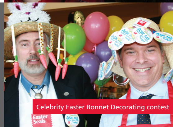
Celebrity Easter Bonnet Decorating contest