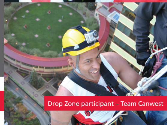
Drop Zone participant – Team Canwest

On the cover: Camper traversing High Ropes course