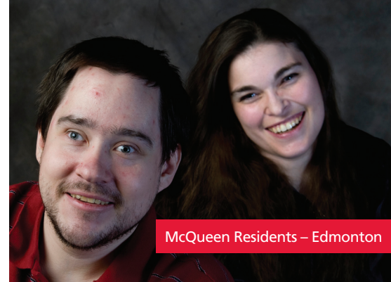
McQueen Residents – Edmonton