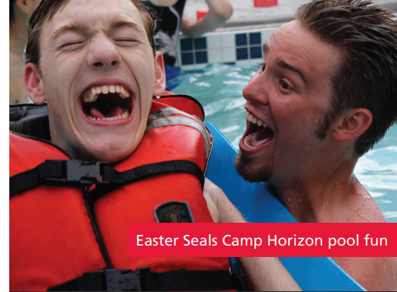
Easter Seals Camp Horizon pool fun